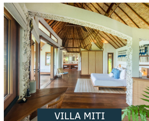
VILLA MITI 61m2 - 656 sq ft