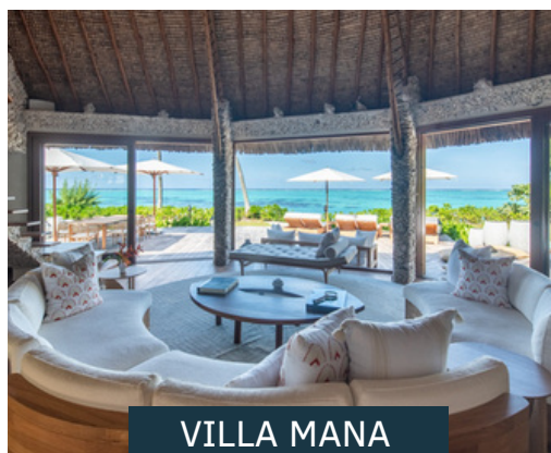
VILLA MANA 103m2 - 1108 sq ft