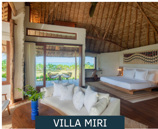
VILLA MIRI 72m2 - 775sq ft

The property offers 3 two-person villas designed and decorated by local designer Alain Fleurot.